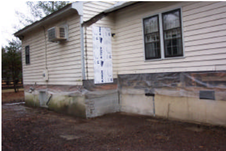
View of St. Seraphim's with the deck removed