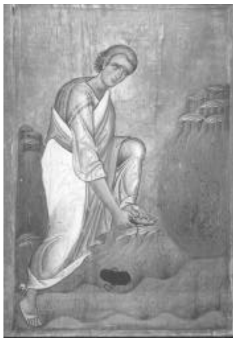
The Prophet Moses removing his sandal

...[M]odern archaeological discoveries have completely discredited the argument of radical critics that Moses could not have written the Pentateuch because writing was unknown in his day. Writing is now known to have been in use as early as 3000 BC, and extremely common by the time of Abraham, who lived six centuries before Moses. Among