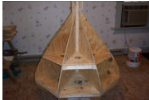
The beginning phase of the new cupola