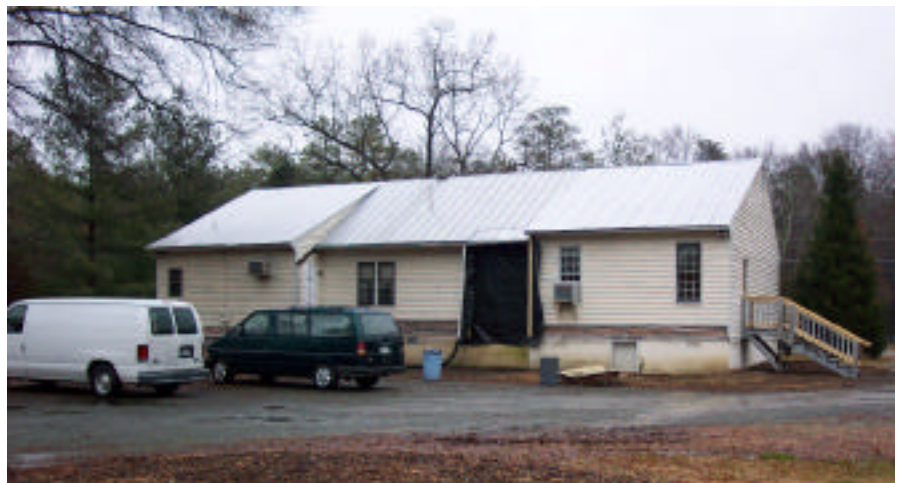
View of the back of St. Seraphim's Church