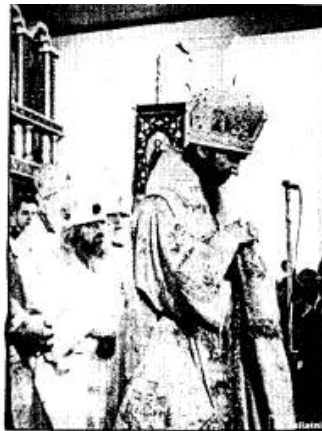
The Metropolitan delivers a sermon on the day of his enthronement, 1964; behind him stands Blessed Archbishop John (Maximovitch) (†1966)

With much love in our Lord, ✠ Metropolitan Philaret President of the Synod