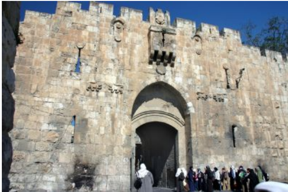
Saint Stephen's (Lions) Gate in Jerusalem This is the place where Saint Stephen was martyred.

Y ESTERDAY the Master came, * to be with us in the body; * and today His faithful slave * departeth out of the body; * yesterday the King was born * in the flesh for our sakes; and today the servant suffereth death by stoning; * for His sake is perfected * the first of Martyrs, * Stephen the truly divine.