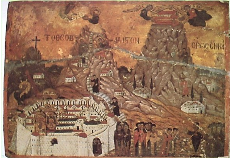
AN ANCIENT ILLUSTRATION SHOWING MOUNT SINAI ON THE LEFT, AND, APPARENTLY, ST. CATHERINE'S MOUNTAIN ON THE RIGHT, WITH THE MONASTERY AT THE FOOT OF MOUNT SINAI.